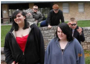
Winner of "best team photo in Hatten park"