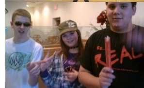
Mission - Bring back chopsticks!