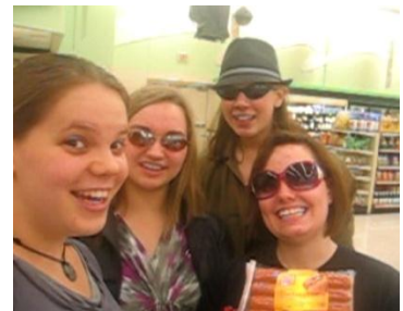
Mission - find Oscar Meyer wieners and sing the song... on video.