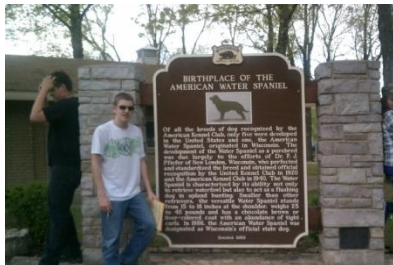
Mission - find out who was the man mentioned in Franklin Park and what he did.