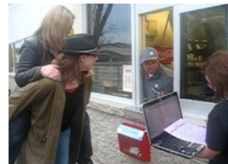
Mission - go through the Burger King drive through piggy back style... order a small soda, drink it, and belch... on video.