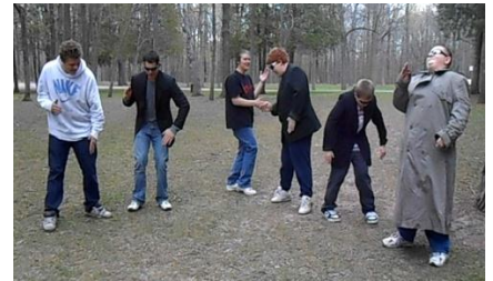
Mission - Get at least two strangers to "flash mob" and dance with you. We are all doing the robot dance.