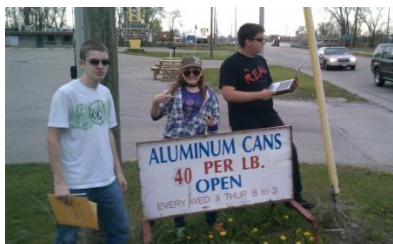
Mission - What is aluminum worth on Shawano St?