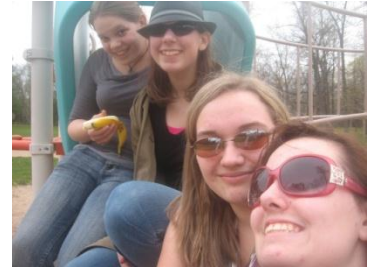
Mission - Get a photo of all team members on a playground slide